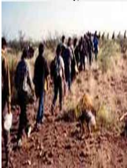
Illegal Immigrants Crossing a Ranch in Cochise County Arizona

IT IS GOOD TO KNOW THAT SOME TAKE THEIR OATH OF OFFICE SERIOUSLY AND WILL ACTUALLY TRY AND DEFEND THEIR CITIZENS