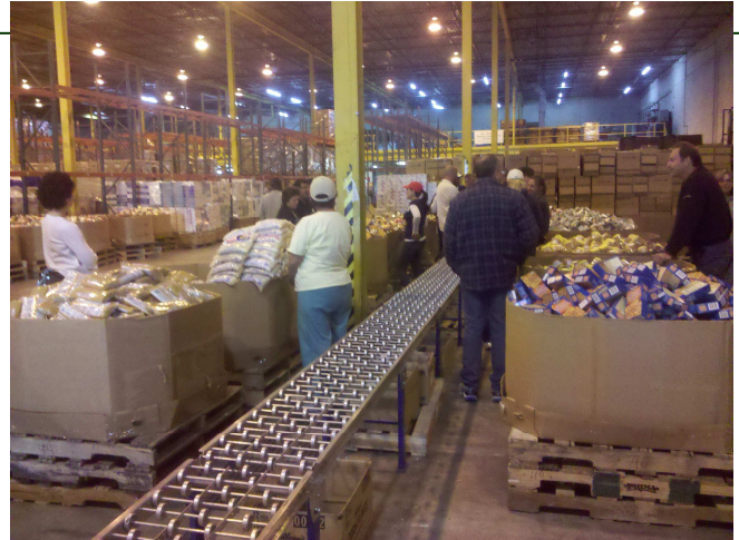
Community Food Bank Foodbox Assembly Line

Volunteering must come from within and must be enjoyed for what it is... helping other people.