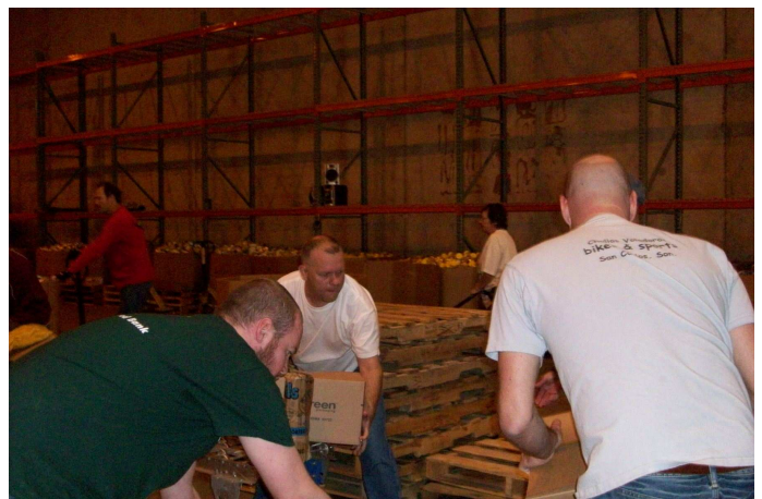
The end of the line-Food boxes on pallets

Apex will continue to serve the community that we are a part of as long as the doors are open. We will give back when we can. We will donate when we can. We ask that you consider taking some time and help those less fortunate.